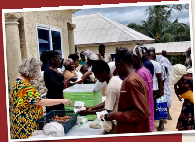
MY GOOD FRIEND AND CO-WORKER JUST BECAME THE CHIEF OF HIS VILLAGE