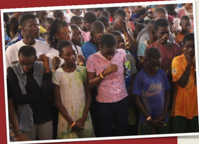
PATIENCE USING CRAFTS TO SHARE GOSPEL