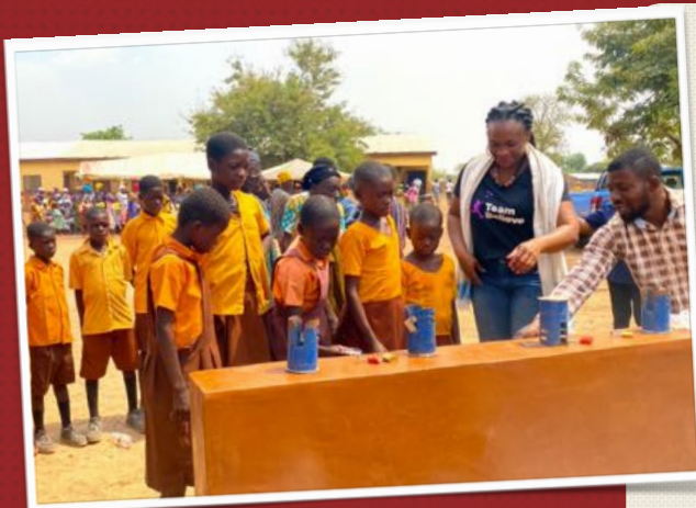
PATIENCE AND MERCY IN VILLAGE